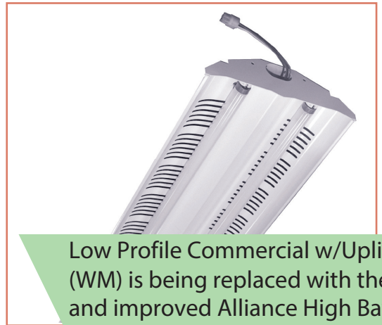
Low Profile Commercial w/Uplight (WM) is being replaced with the new and improved Alliance High Bay (ALI)

PHOTOMETRICS - Please visit our web site at www.lsi-industries.com for detailed photometric data.