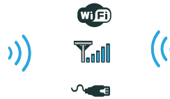
WiFi, Cellular or Ethernet Connection