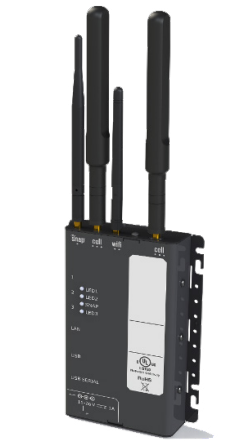
Site Manager Controller