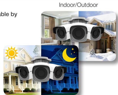
Automatic Night Vision