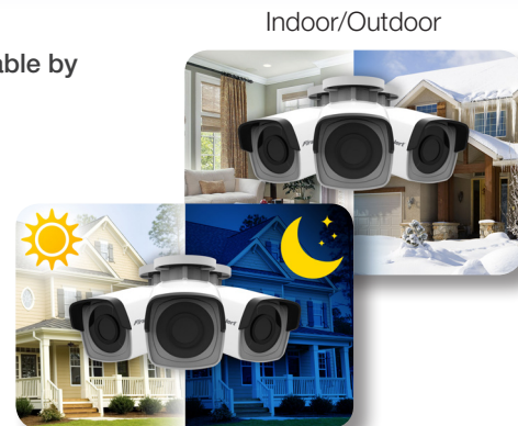
Automatic Night Vision