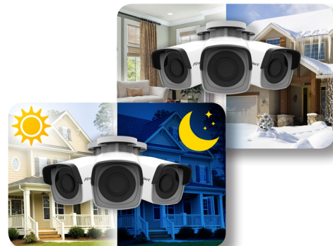
Automatic Night Vision