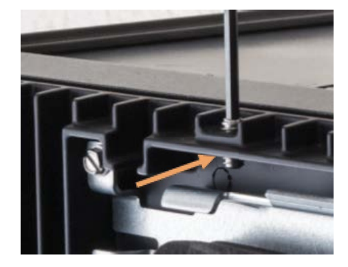
Figure 2a Figure 2b

For door frame up only: Install 1/4"-20 x 3/4" hex socket cap screws (provided in pre-packaged hardware) into the top of the mounting plate (replacing 1/4"-20 screws from step 1), turning twice is sufficient.